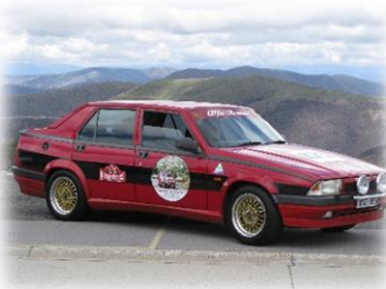
Left: Founder of the Alpine Tours at Mt Hotham

Friday 12 th : Wodonga to Falls Creek via Mitta Mitta (for a gastro-pub lunch) With an optional walk to Wallace Hut on the Bogong High Plains, subject to weather and timing.