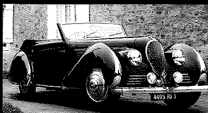
DELAHAYE 135 MS CABRIOLET

Let loose in the car from A Clockwork Orange